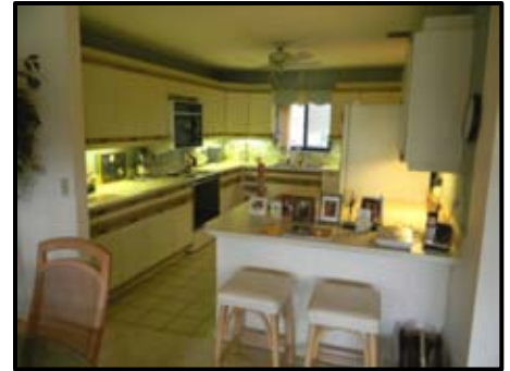
Kitchen with Lots of Cabinets