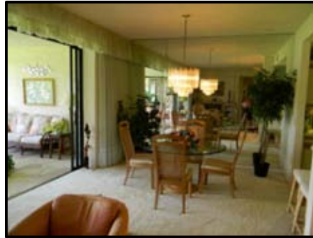
Custom Mirrored Dining Room