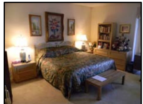
Master Bedroom with Private Bath