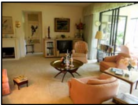
Bright Living Room Opens to Florida Room